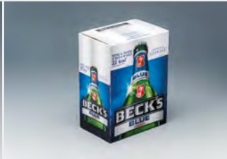
fully enclosed pack