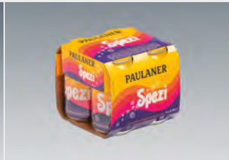
Sleeve with EAN-Code Cover