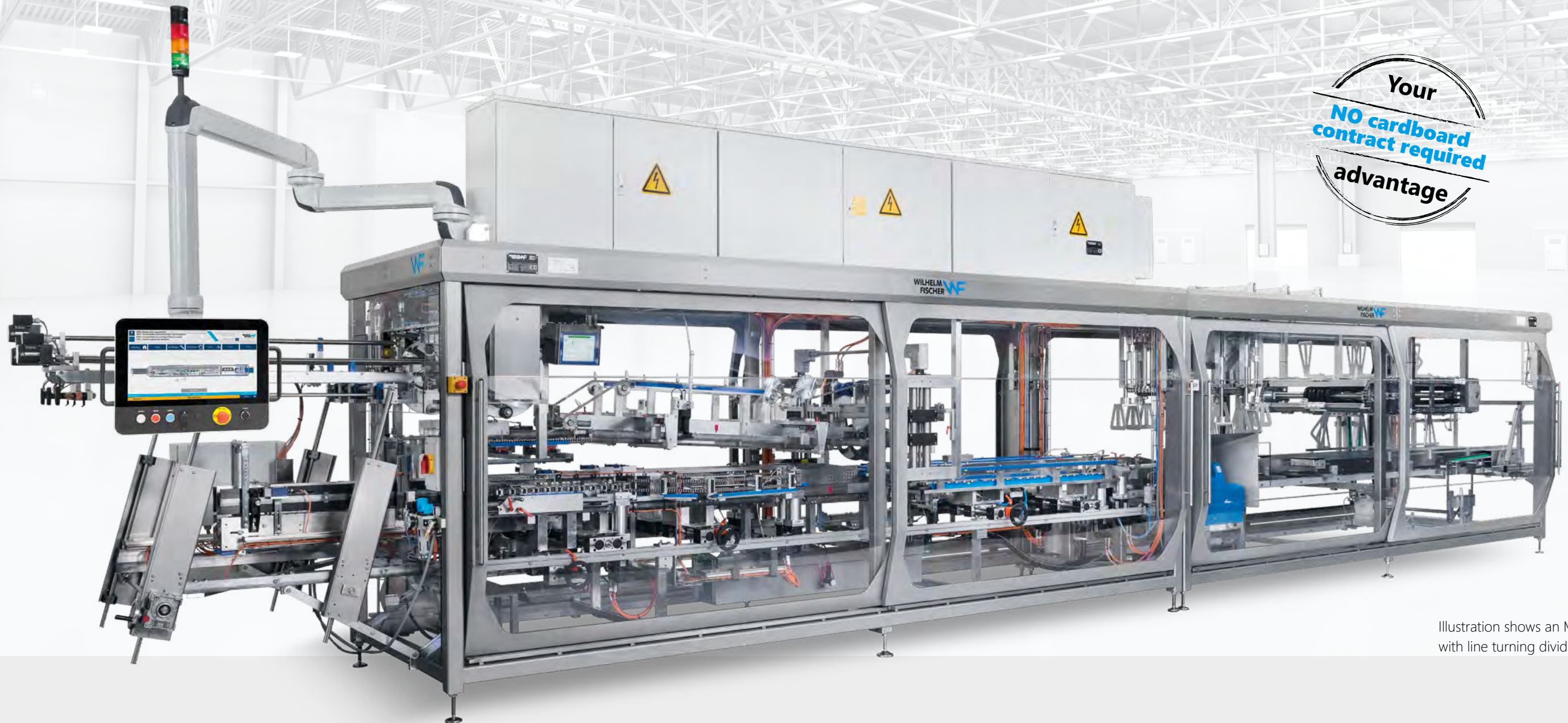
Illustration shows an MCP200 with line turning divider