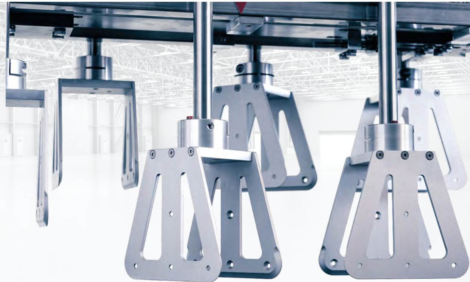
Illustration shows a line divider

In addition to our Multipack-machines, we also offer line-dividers and line-turning-dividers to arrange formations of packs for e.g. tray- or foil-packers.