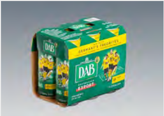
Sleeve with EAN-Code Cover